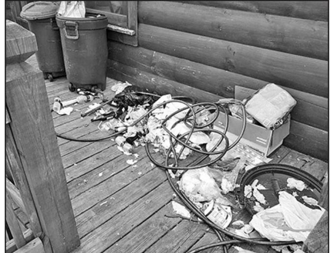
A hungry bear can create quite a mess.

The intentional and unintentional feeding of bears teaches them to approach homes and people for food which is a recipe for Human-